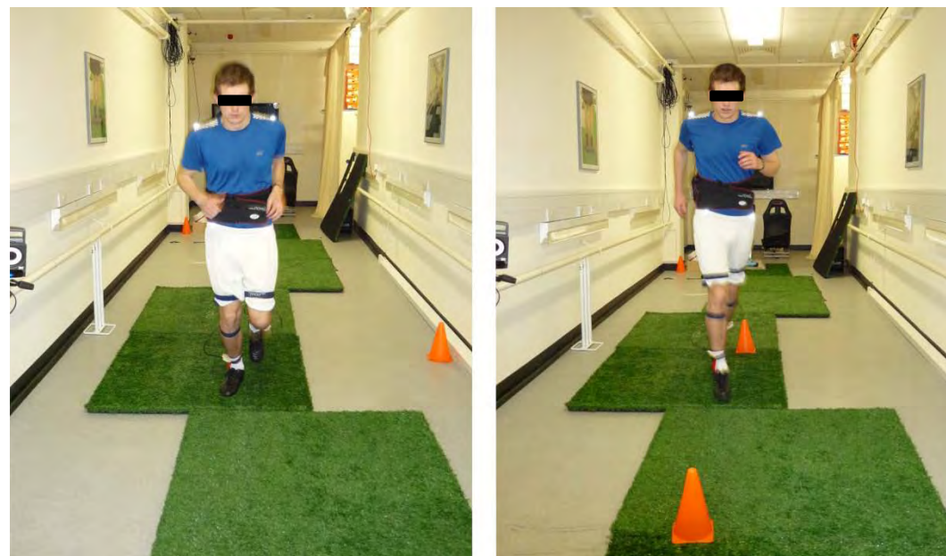
Figure 3. Test track of artificial turf. (Left) Straight trials; (Right) Slalom trials