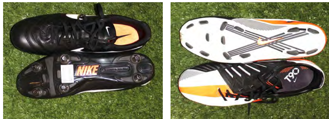
Figure 1. (Left) Nike® Tiempo Legend IV; (Right) Nike® T90

Ethical approval was obtained. A total of 18 healthy, male football players participated as volunteers for this study. Nike® shoes (Figure 1) chosen for this study were Nike® Tiempo Legend IV (studs) (left) and Nike® T90 (blades) (right).